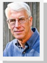
Yep. That's me.

As a Seattle speaker and author since 1992, I believe learning should be fun, because the more fun you have the more you do. The more you do, the quicker you learn. The quicker you learn, the better you get. And you're never discouraged when you're having fun.